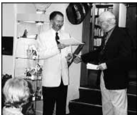
Fola Executive Officer receiving awards on behalf of Unley Friends and Marion Friends