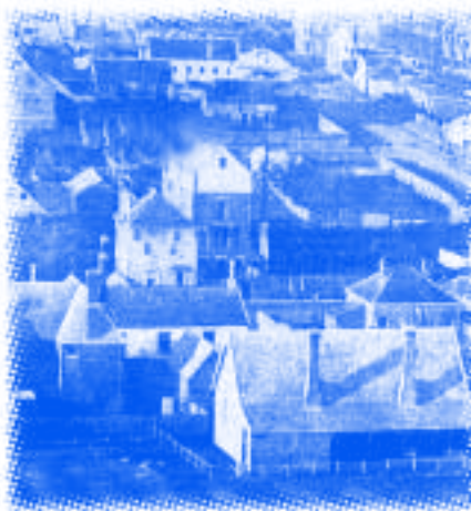
a detail of the panorama

The Friends' objective is to publish significant items from the library's collection in order to promote the collection and assist in the interpretation and understanding of Launceston's past. Revenue gained from the publishing program will be used to conserve the collection, fund future publications and to promote the library, in particular its local studies collection.