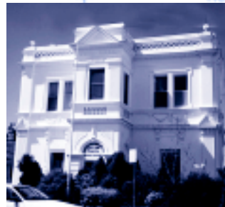
The original Wingecarribee Library - a crowded and poorly lit space.