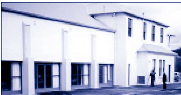
The new and improved Library nears completion. After the dark and gloomy atmosphere of the old library building, staff are very impressed by the light and space.