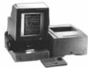
The $19,085 Microfiche Reader Printer ($12,000 of which was provided by the Friends of Wingecarribee Shire Libraries)