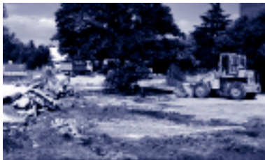
Site for future Wingecarribee Library. Despite problems with the local water table and the size and shape of the site, the building was completed on time.

Wingecarribee were the recipient of a FOLA Best of Friends Award for 1999.