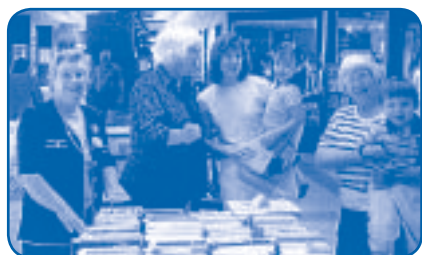
Bumper booksale underway at Nriootpa Shopping Centre