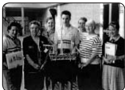
Local history competition prize winners shown holding their projects