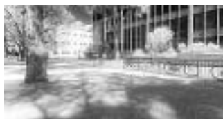
Committee meetings are held at the Baillieu Library, University of Melbourne, Parkville.