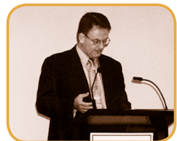
Mark Latham MP (Assistant Federal Shadow Treasurer) addressing FOLA conference.