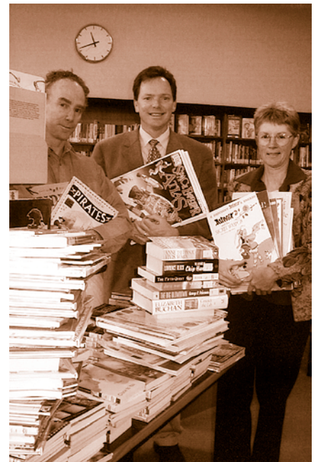
Castlemaine Library and visit from Minister for Local Government