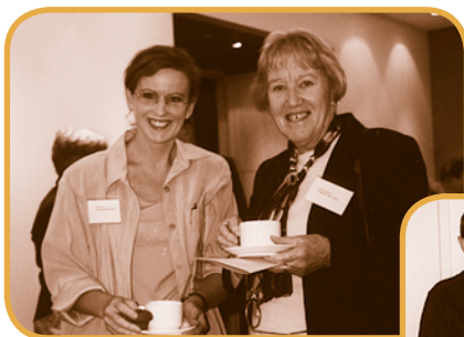
Friends enjoying the conference!