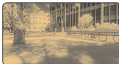
Committee meetings are held at the Baillieu Library, University of Melbourne, Parkville.