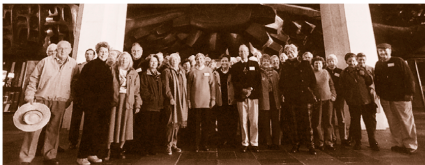
Friends of the National Library about to set out on 'In the Footsteps of Burke and Wills', in June 2002