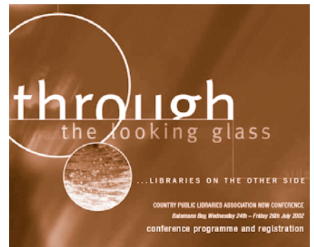
The cover of the 2002 NSW CPLC program

for networking and socialising for FOL group members on both sides of the border.