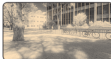
Committee meetings are held at the Baillieu Library, University of Melbourne, Parkville.

27 August AGM — Altona City Library (Vic), 8 October, 10 December.