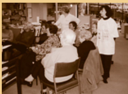
In service training day for Friends of Altona Library