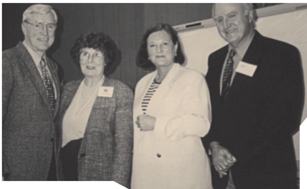
FOLA's Canberra Biennial Conference at the National Library