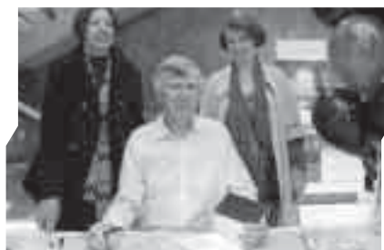
David Williamson at the National Library