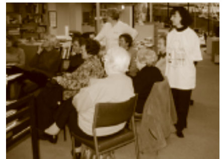
In service training day for Friends of Altona Library

Altona (Vic) Launched a permanent Booksale Room in a disused library garage. The Bookroom is open to the public for sales each week. The room has customized shelving to allow for easy browsing and selection.