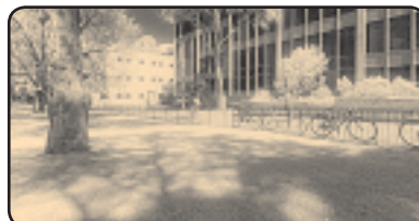
Melbourne Committee meetings are held at the Baillieu Library, University of Melbourne, Parkville.