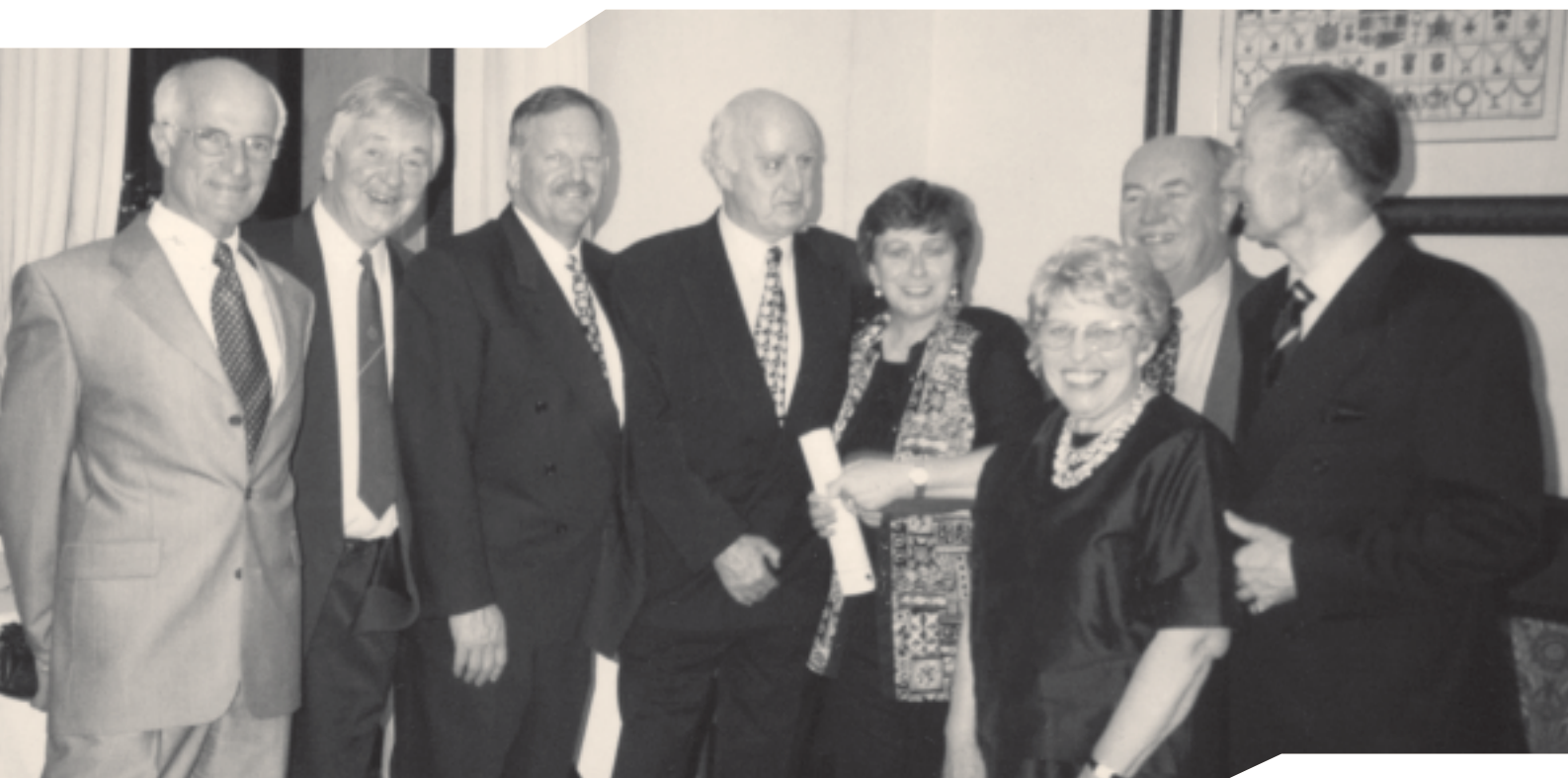
FOLA's Fifth Anniversary Dinner in Melbourne