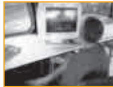
Scenes from Cooloola Shire Libraries

Gladstone (Qld) Friends are offered a discount on the use of the Internet terminals and printing from PC's.