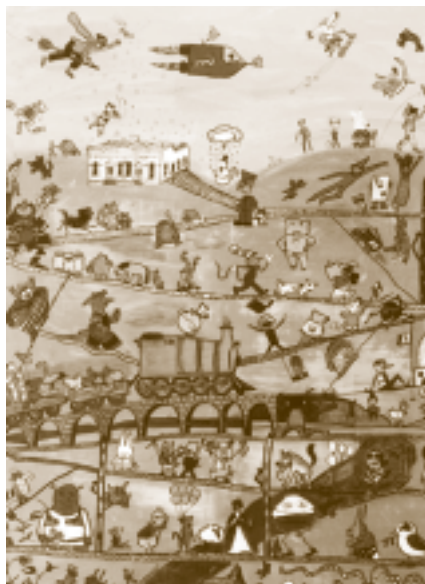
Poster: Junior Friends of Alexandra Library

Inverloch (Vic) Organised 'Books on Wheels' to the emergency housebound residents. The President is also a member of the Library Advisory Committee on the regional library corporation.