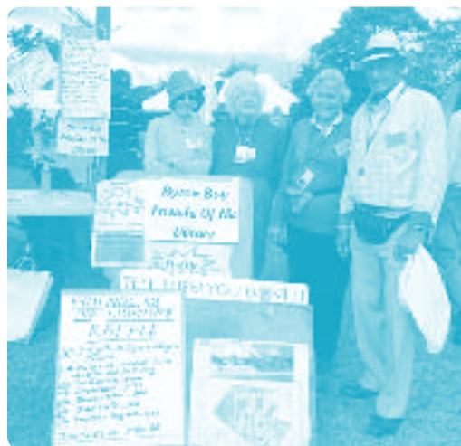
Members of the Byron Friends of the Library campaign for the new Byron Bay Library