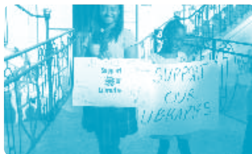
The Friends of St Thomas Public Library protesting for increased library services

http://www.facebook.com/friends.of.stt.public.libraries