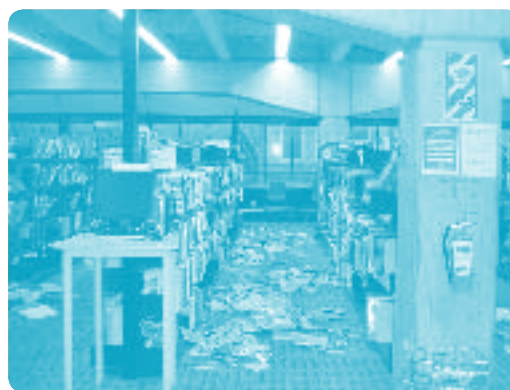
Christchurch Central City Library after the 2010 earthquake

Finally, let us think of the Friends of Christchurch City Library in New Zealand, who continue to be challenged by the consequences of last year's earthquake in that city.