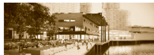
Docklands Library and Community Centre (visualisation)

“FOLA remains one of the few national associations for Friends of Libraries, although threats to public libraries in countries such as the UK have stimulated forms of regional or national association.”