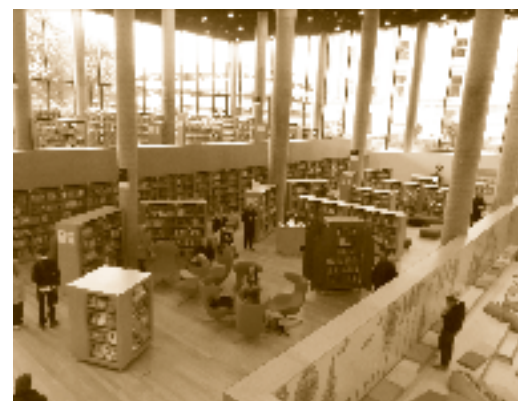
Images of the Library of Birmingham