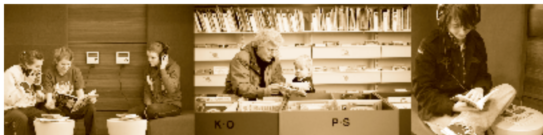
Images of Coventry Library Stirling, South Australia

state or regional groups of Library Friends to come together to share their experiences and knowledge, and to help spread word about their value to councils and library managers. There is a statement to this effect on the FOLA website www.fola.org.au .