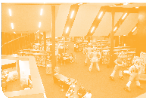
Albury Library exterior and interior