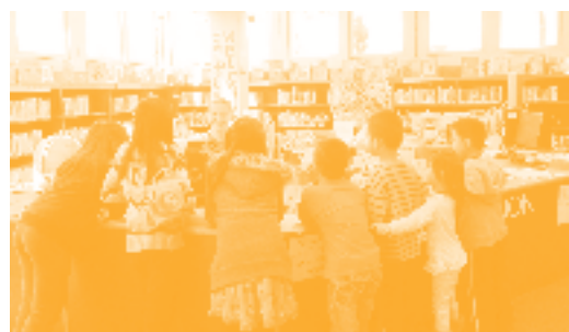
Northeast Regional Library, Free Library of Philadelphia